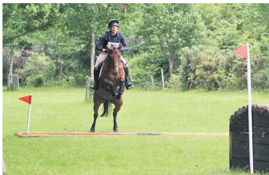
Riders must identify the priority of each session for both themselves and the horse

➤ Observation: Assessing what your horse is offering today. What behav-